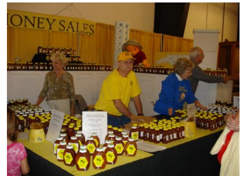
Honey entries at the 2010 State Fair:

Many children enjoyed honey sticks and learning about bees. The beekeeping education area featured an observation hive, a bee cage, and many volunteers answering questions and teaching fair goers about honey bees.